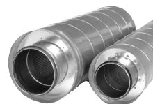
SIL Acoustic attenuators