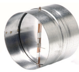
CAR Backdraft Damper