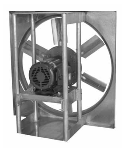
Direct Drive Sidewall Propeller Fans (Exhaust and Supply)