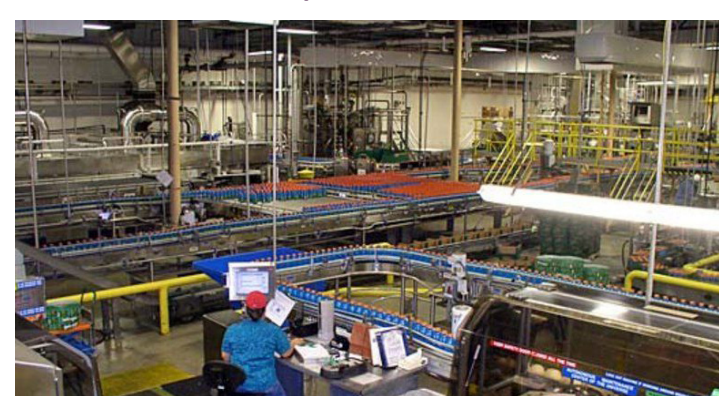
Sports Beverage Facility