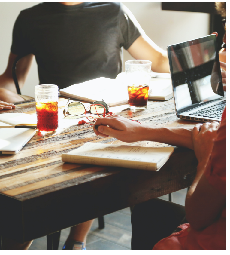
MITIGATING COVID-19 IN THE WORKPLACE

As employees return to the workplace, it is important to understand how proper ventilation can protect occupants of buildings from viruses or pollutants like COVID-19.