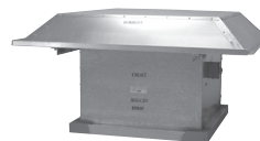
HRSB & HRSD