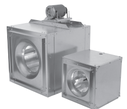
SQB & SQD

6393 Powers Avenue Jacksonville, FL 32217 800.961.7370 800.961.7379 www.solerpalau-usa.com