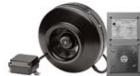
Fan with Interlock