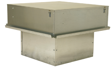
Model CSF Hooded Design