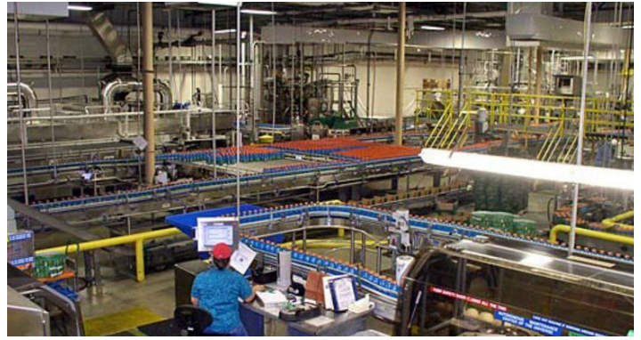
Sports Beverage Facility