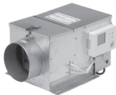
reRefresh Filtered Supply Fans with EC Motors RF-160EC or RF-120EC