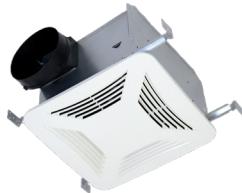
Premium CHOICE DC Motor Models PCD