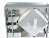
Total Recovery ERV- Commercial TRCe