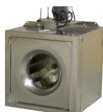
Direct Drive Square Inline Centrifugal Duct Fan eSQD