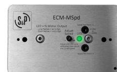
ECM Multi-Speed Control ECM-MSPD