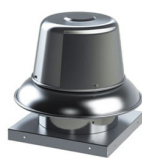
Downblast Centrifugal Power Roof Ventilator SDBDe